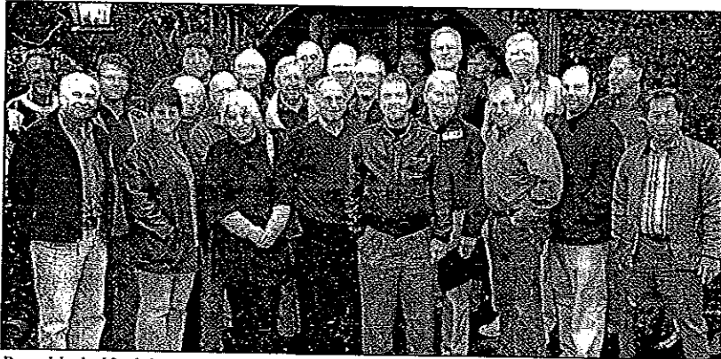
Roughly half of the 48 members of the Lamorinda Sunrise Rotary pose for a picture after their weekly breakfast meeting at Postino restaurant in Lafayette.

The senior of the pair is The Rotary Club of Lafayette. Founded in 1946, it meets Thursdays at noon at the Oakwood Athletic Club. The junior is The Rotary Club of Lamorinda Sunrise (LSR), established in 1987. (The