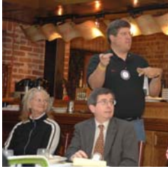
does anyone know what's going on?