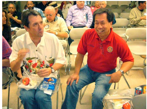
Two goofy LMSR guys in leadership training