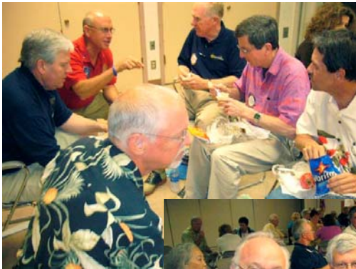
The leadership "BrainTrust" .....hmmmm, more on that later, after we think about it