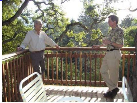
The tree house

And now, although this is the April 27th morning issue, we magically take you to the same evening, the next morning, and even into the next afternoon. Friday evening saw the long-awaited Durlister TGITLFOTM. You had to earn your way there -- parking your car was almost