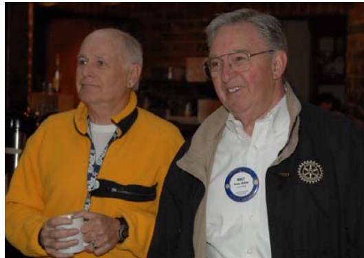
Dudes and more dudes.....