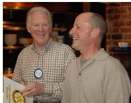
A warm welcome