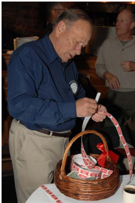
1 for 2 or is it 2 for 1...whatever!