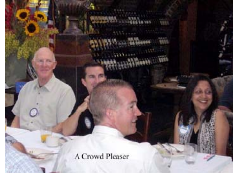
A Crowd Pleaser